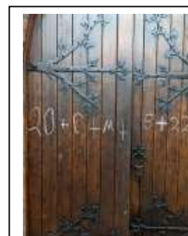
Crib scene and Chalking the door, at St Luke's